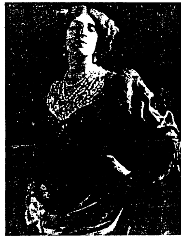
Lady Ottoline Morrell, 1912.

Garsington became a regular, celebrated headquarters for the arts set. Weekends in the country, turned into months in the country, as artists such as Henry Lamb (briefly a lover) and Dorothy Brett moved into cottages on the Garsington estate. The lineup of house guests might include Aldous Huxley, Katherine