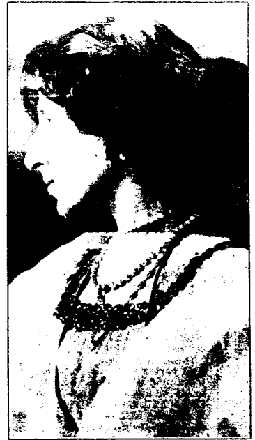
Tribune photo illustration

Ottoline wanted to admire him. She encouraged him, propped him up in a political career that was brave, arduous and slightly pathetic. He was extraordinary in tolerating his wife's numerous liaisons; he himself had little or no sexual interest in her, preferring relentless