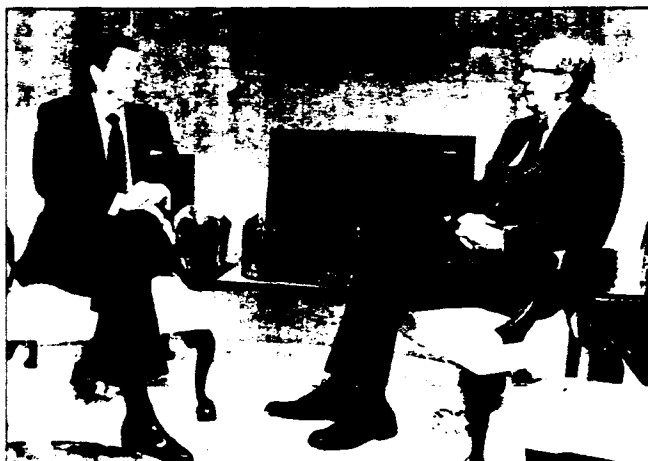
George J. Stigler (right) and then-President Ronald R. Reagan meet in 1982, when Stigler won the Nobel Prize for Economics.

Luis W. Alvarez, Physics, 1968 Kenneth J. Arrow, Economic Sciences, 1972, with Sir John R. Hicks George Wells Beadle, Physiology or Medicine, 1958, with Edward Lawrie Tatum and Joshua Lederberg. • Saul Bellow, Literature, 1976 Hans Albrecht Bethe, Physics, 1967 Konrad Bloch, Physiology or Medicine, 1964, with Feodor Lynen Herbert C. Brown, Chemistry, 1979, with Georg Wittig James McGill Buchanan, Economic Sciences, 1986 Alexis Carrel, M.D., Physiology or Medicine, 1912 Owen Chamberlain, Physics, 1959, with Emilio Gino Segre • Subrahmanyan Chandrasekhar, Physics, 1983, with William Fowler Arthur Holly Compton, Physics, 1927, with Charles Thomson Rees Wilson • James W. Cronin, Physics, 1980, with Val L. Fitch Clinton Joseph Davison, Physics, 1937, with Sir George Paget Thomson Edward Adelbert Doisy, Physiology or Medicine, 1943, with Henrik Carl Peter Dam Sir John Carew Eccles, Physiology or Medicine, 1963, with Sir Alan Lloyd Hodgkin and Sir Andrew Fielding Huxley. Thomas Stearns Eliot, Literature, 1948 Enrico Fermi, Physics, 1938 Manhattan Project James Franck, Physics, 1925, with Gustav Hertz Jerome Friedman, Physics, 1990, with Henry Kendall and Richard