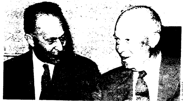
Science adviser George Kistiakowsky with President Eisenhower in 1960

edgeable scientists on nuclear weapons: "Given the present geopolitical trends and the quality of political leaders that burden mankind, it would be a miracle if no nuclear warheads were exploded in anger before the end of this century and only a bit smaller miracle if that did not lead to a nuclear holocaust."