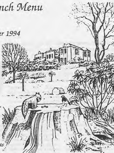
Pembroke Lodge, Richmond Park Telephone: 081-825 5207

Beef Consommé Fresh Vegetable Soup Prawn Cocktail Honeydew Melon ☆ ☆ ☆ Traditional Roast Turkey with Bacon Roll, Chipolata Sausage, Sage and Onion Stuffing and Cranberry Sauce ☆ ☆ ☆ Roast Potatoes Buttered Carrots, Brussel Sprouts ☆ ☆ ☆ Christmas Pudding with Brandy Sauce ☆ ☆ ☆ Mince Pies ☆ ☆ ☆ Coffee & Almond Biscuits ☆ ☆ ☆ Fresh Fruit Roast Chestnuts