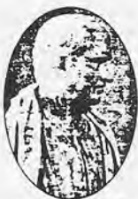
Clara offered natural law; Aquila's temple commanded, "Know thyself": Thus as now, we seek order from chaos.

This book review of Jostein Gaarder's Sophie's World: A Novel about the History of Philosophy and Gareth B. Matthews's The Philosophy of Childhood appeared in The Boston Sunday Globe , October 30, 1994, pp. B14-B16. It is refreshing to see a mass circulation American newspaper offering such an article on quasi-philosophical and philosophical books of note. If anyone has read the Gaarder book, we are curious to be informed whether Russell in some way figures in the literary account of the major philosophers of Western history.