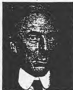
Bertrand Russell

But the cross also proves that God really loves His creatures. It proves that evil and sin are not due to any fault on God's part; and it shows how much God himself is willing to give up in order to make His children happy. Evil men and evil angels have constantly charged God with being a tyrant; the cross refutes this, and also shows how God handles this great rebellion. And while neither the Bible nor a rational philosophy gives us any promise that all of God's creatures can be won back by such an exhibition of limitless love, the former does testify that by this method of God in dealing with rebellion, the universe will ultimately be more secure, more happy, and more completely loyal to their Creator than if this horrible nightmare of sin had never occurred. This final outcome is the ultimate justification for God's running the risk of such