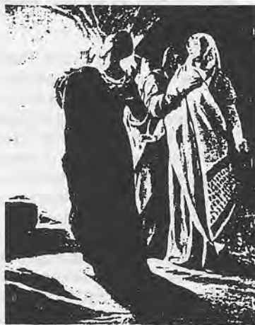
The women at the tomb. Men will live again because Christ rose from the dead.

"Brief and powerless is man's life; on him and all his race the slow, sure doom falls pitiless and dark. . . . The life of man is a long march through the night, surrounded by invisible foes, tortured by weariness and pain, towards a goal that few can hope to reach, and where none may tarry long. One by one, as they march, our comrades vanish from our sight, seized by the silent orders of omnipotent Death."— Bertrand Russell, "Mysticism and Logic," p. 66.