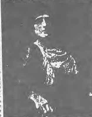
Ottoline Morrell at thirty-nine