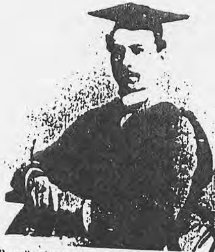
Russell: educated to be Prime Minister

How much of this material has been published before? Fairly extensive selections from the Greek Exercises were included in My Philosophical Development and in the autobiography. None of the study essays seem to have seen the light of day before. Russell, apparently, included some of the school essays in an early draft of his autobiography but deleted them later, and Alan Wood never carried out a plan to use the philosophy essays in a study of Russell's philosophy. One of the papers