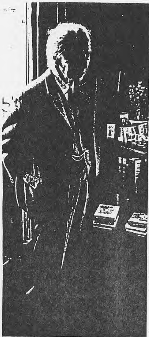
[HIS 95TH BIRTHDAY]

There is a control in these words, a suppression of personal bitterness and pain wholly characteristic of the man, which gives no hint of the vicious weapons of attack that were wielded against him in his last years, the wounds he suffered, or the anguish of the battle he fought. Even now, one can only guess at their measure. To attend the press conference announcing the War Crimes Tribunal, for example, Russell, now a few months shy of ninety-five, undertook the long trip to London in the dead of winter. Caxton Hall, where the conference was held, has a winding staircase which must have seemed interminable to the old man as he mounted them at snail's pace