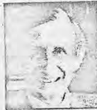
Freeman Dyson.

In 1948, J. Robert Oppenheimer, director of the Institute for Advanced Study in Princeton, appointed Freeman Dyson, a young English physicist, to the staff, and told him, "Follow your own destiny." Mr. Dyson is still there, "Disturbing the Universe," as the title of his 1979 book goes. He first began to do so in 1941 after being recruited by C. P. Snow to do research for the Royal Air Force when Britain was under siege by the Luftwaffe. In 1957, the physicist became an American citizen.