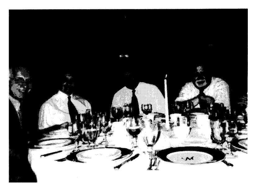
Good Food and Friendship