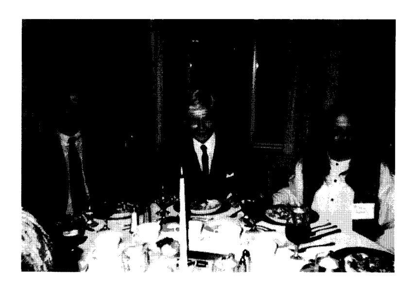
Some Special Guests