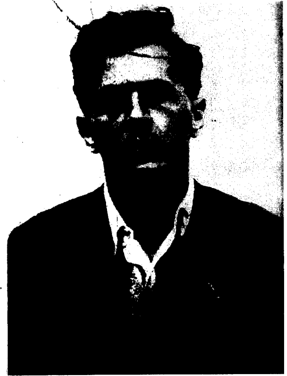
A DIFFICULT MAN

Published by the Bertrand Russell Society with the support of Lehman College-City University of New York