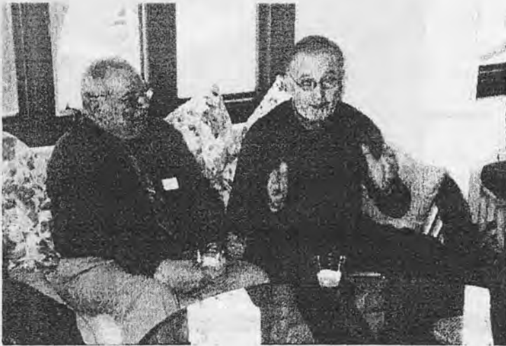
“Russell’s pipe was THIIIS big!”