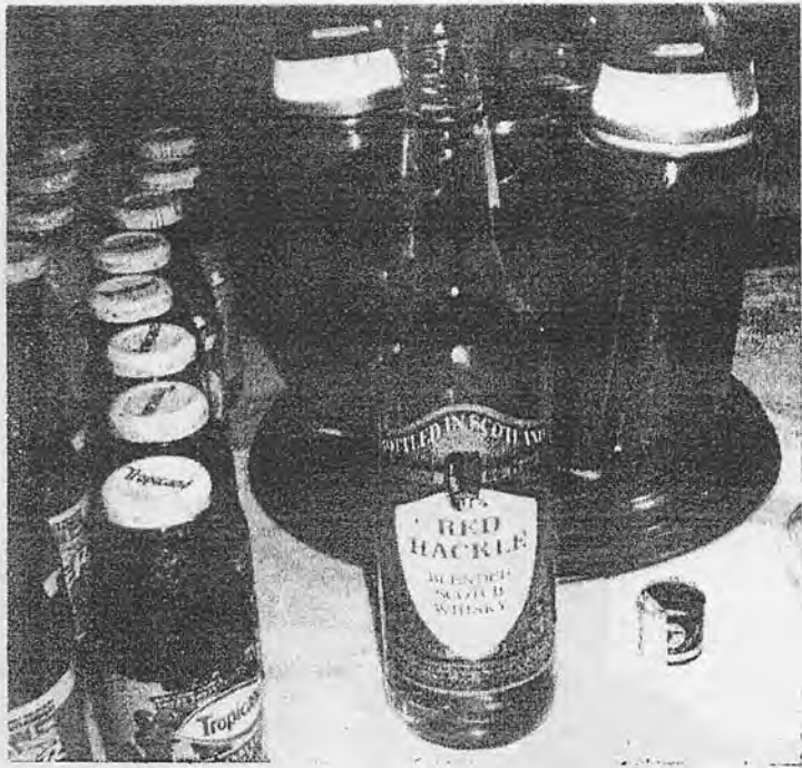
The favored beverage of the meeting.