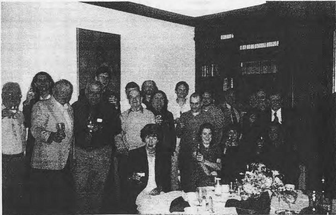
The gang's all here.