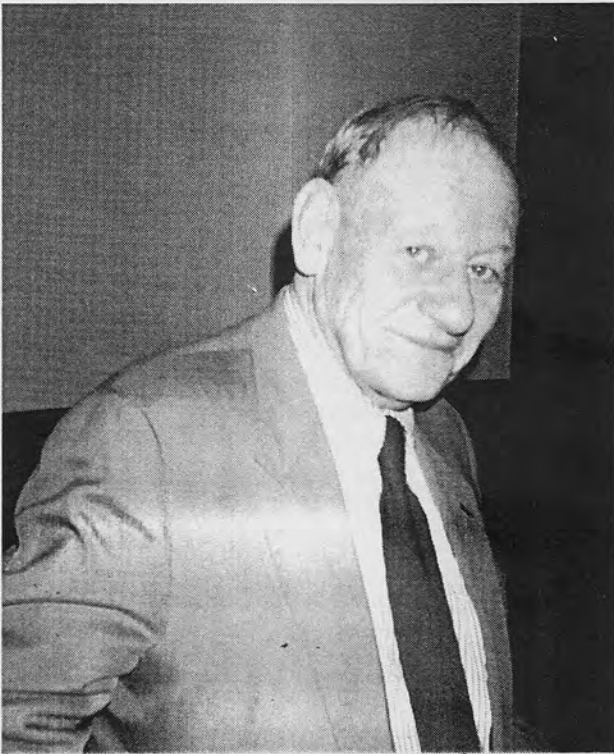
Paul Kurtz in Rochester