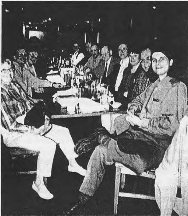
Mistah Kurtz—he in Rochester!