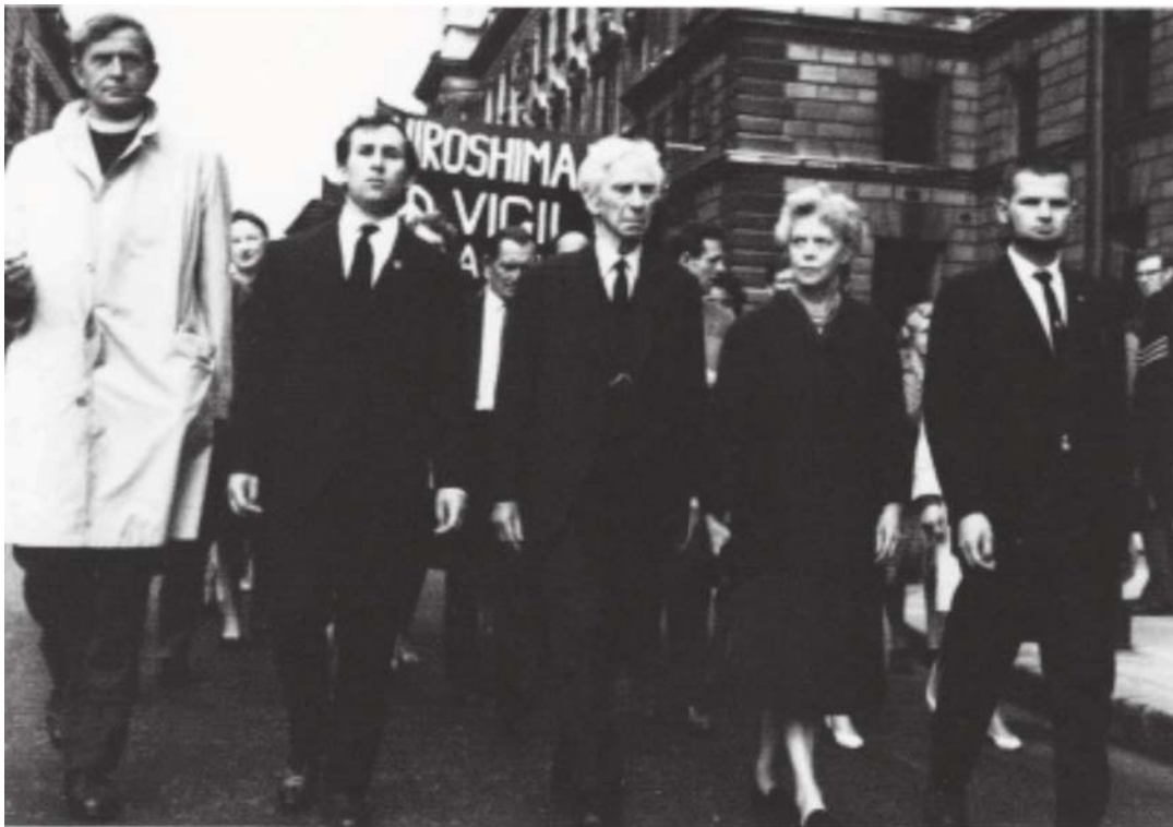
Russell at an Anti-Nuclear Demonstration