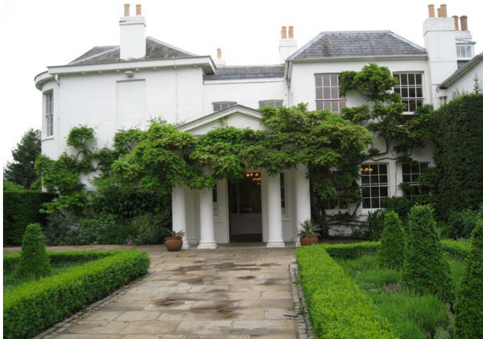
Pembroke Lodge in 2012